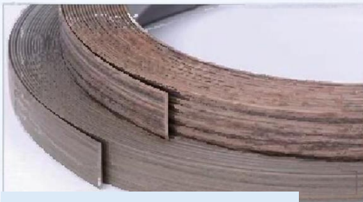
PVC Edge Banding